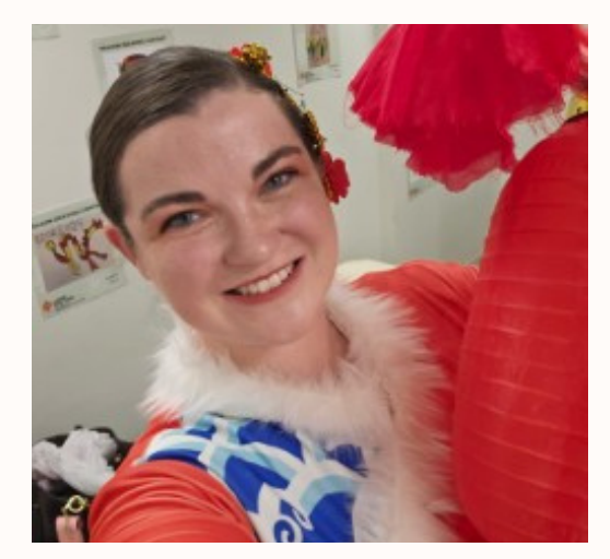
PhD Candidate in Anthropology Emory University

My research interests center on identity formation and identity crisis as continuous psychosocial processes. I am currently investigating identity and crisis alongside people who practice and perform Chinese Dance in the American South, exploring their ambivalent identifications with changing concepts of Chineseness and Southernness in the face of the COVID-19 pandemic and its associated spike in Sinophobia. SPA's network, award and funding opportunities, and newsletter have been sources of wisdom. great connection. motivation as I draft my dissertation, write syllabi, and apply for postdoc and professor positions.